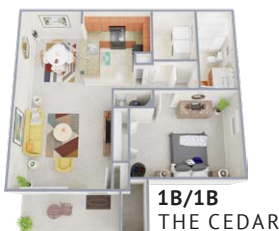
1B/1B THE CEDAR (UPGRADE)