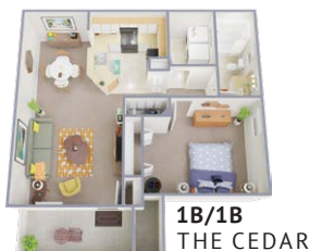
1B/1B THE CEDAR