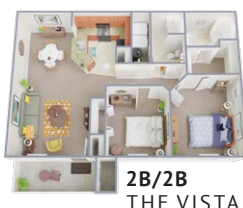
2B/2B THE VISTA (UPGRADE)