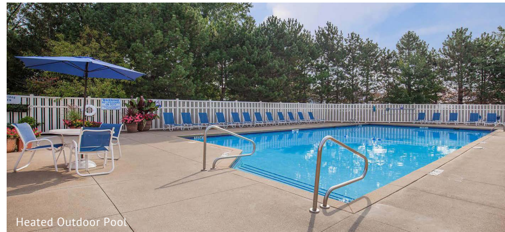
Heated Outdoor Pool