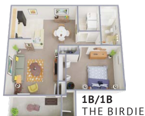
1B/1B THE BIRDIE