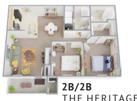
2B/2B THE HERITAGE