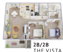
2B/2B THE VISTA